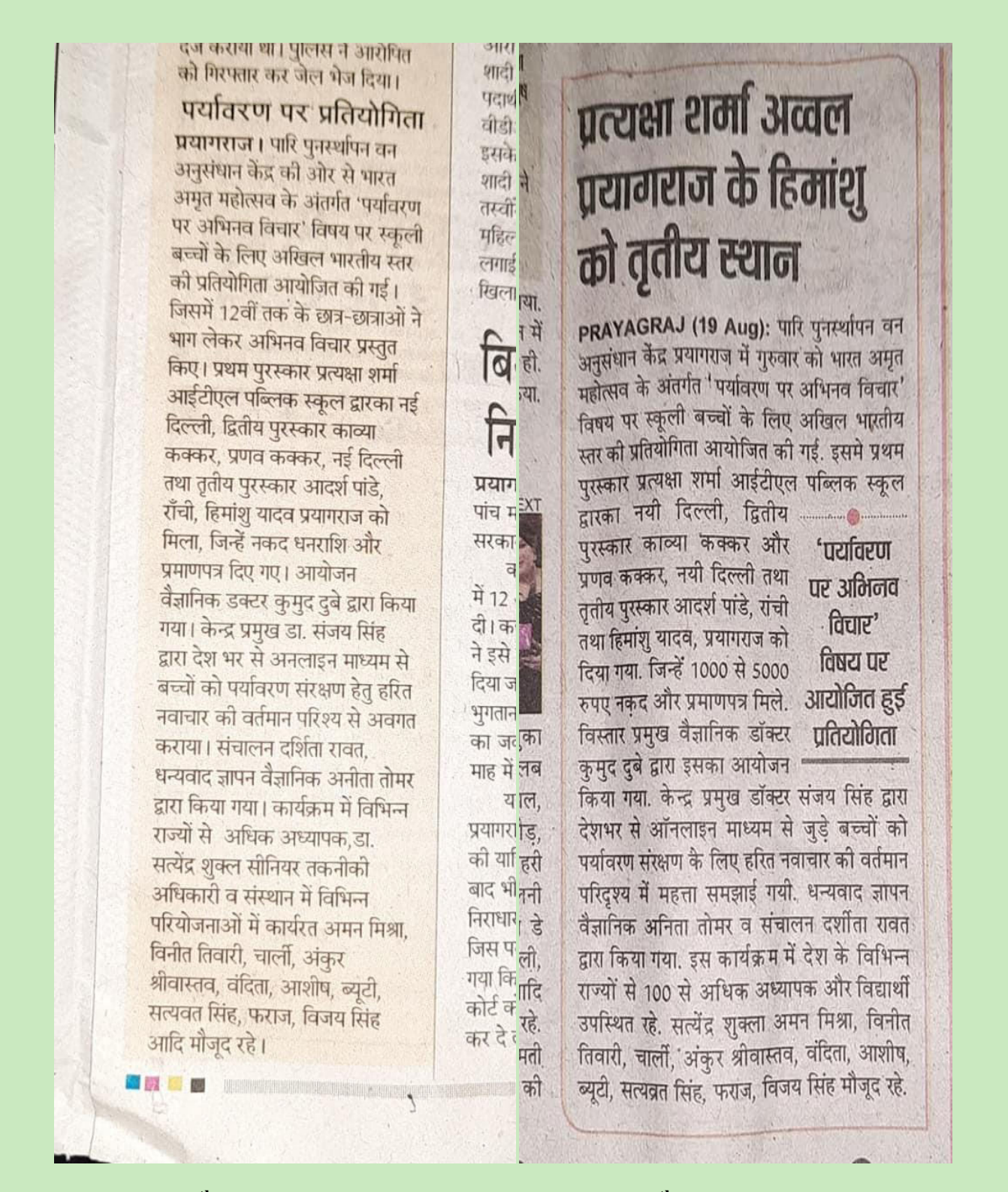
I-NEXT 20<sup>th</sup> August, 2021 RashtriyaSahara 20<sup>th</sup> August, 2021